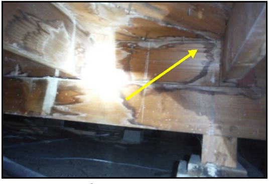
Evidence of dry past water damage