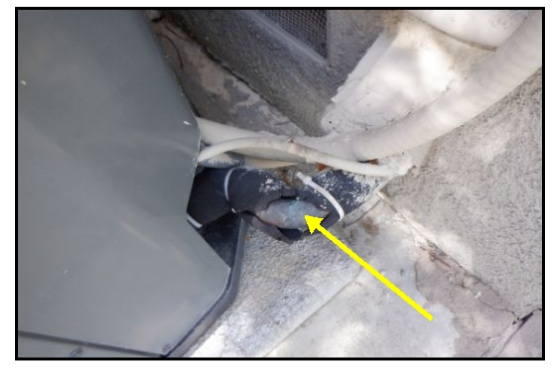
Missing/deteriorated refrigerant line insulation

3.2. Insulation on the air-conditioning condenser refrigerant line was damaged or missing at the time of inspection in areas and should be replaced.