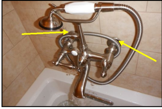
Loose faucet from wall

5.2. The whirlpool faucet was loose from basewall in hall bathroom at the time of the inspection, suggest securing as necessary.