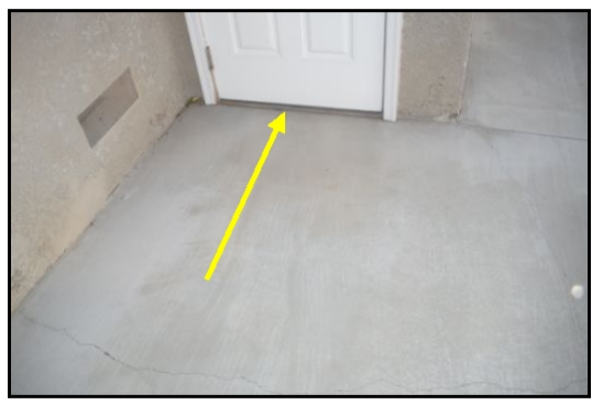
Low areas observed