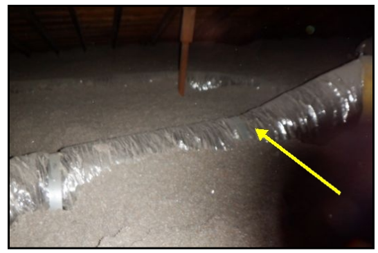
Duct work lying on ceiling joist