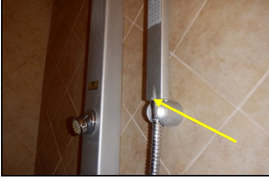
Leaking spray wand in on position