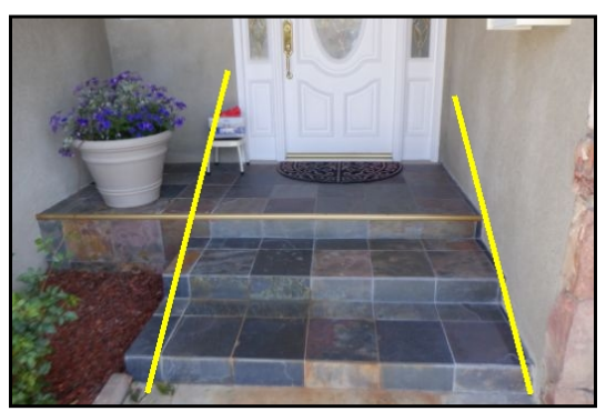
No handrail more than 2 risers