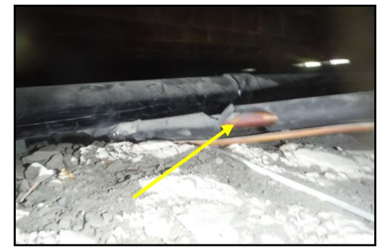
Missing/deteriorated refrigerant line insulation