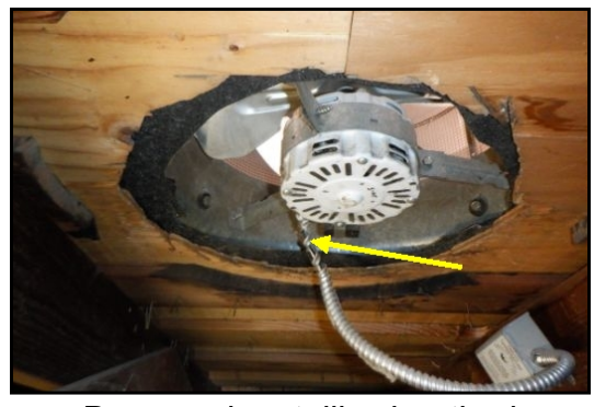
Damaged metallic sheathed

7.2. Metallic sheathed wiring for the mechanical ventilation fan was subject to damage. This is a safety hazard due to the risk of shock and fire. Recommend correction. See attached picture.