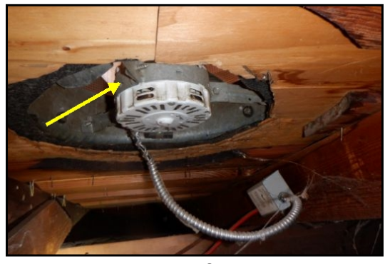
Inoperable fan noted

3.2. The attic fan controlled by a thermostat was inoperable at the time of inspection. Recommend review for repair or replacement as necessary. See attached picture.