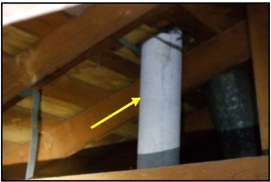
Possible asbestos materials