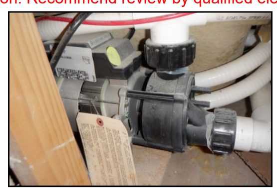
GFCI protection was inoperable

check intake and jets it was functional at the time of the inspection.