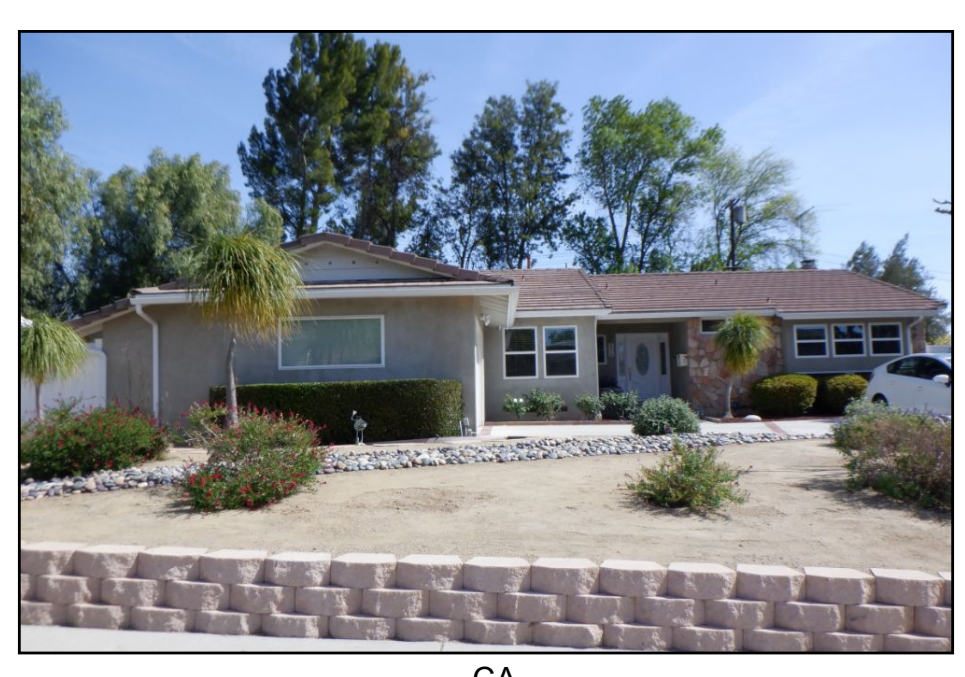
, CA Inspection prepared for: Date of Inspection: 2/28/2021 Time: 12:00 PM Age of Home: 1962 Size: 1875