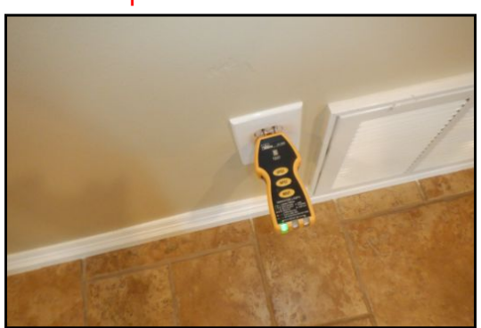
Open ground outlet/GFCI

4.2. Open ground (or 2-wire) outlet were present in different areas of the home at the time of the inspection. This means that the 3rd (round) part of an appliance plug is not getting ground protection. This may be a concern with items such as computers and electronic devices.